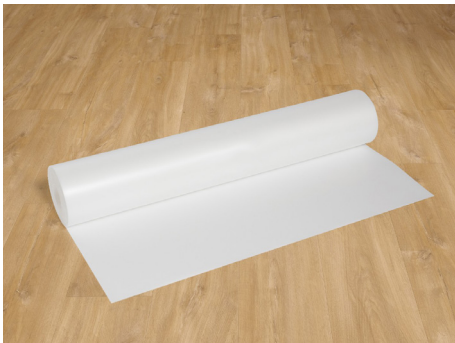
Variety of suitable underlays