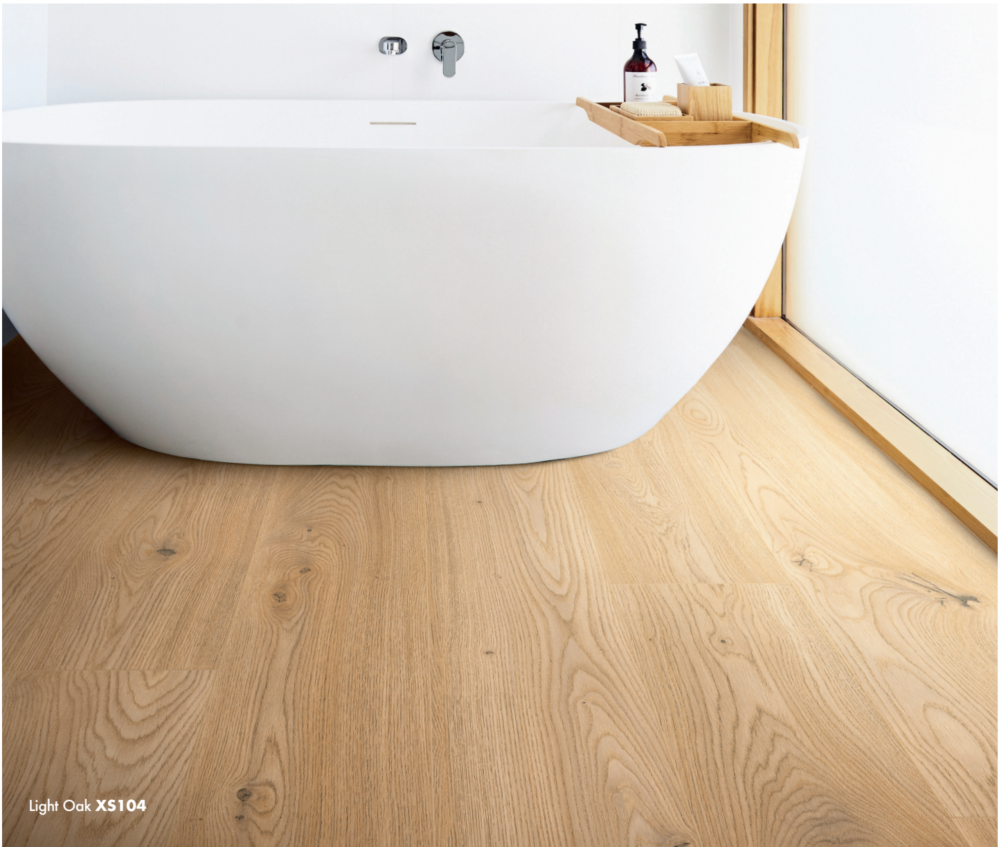
Light Oak XS104

WATER RESISTANT / EASY TO INSTALL / HARDWEARING SUITABLE FOR UNDERFLOOR HEATING