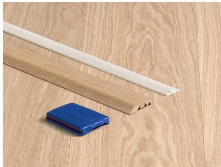
Colour matched multifunctional profile