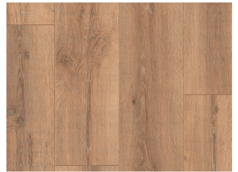
Rustic Mid Oak